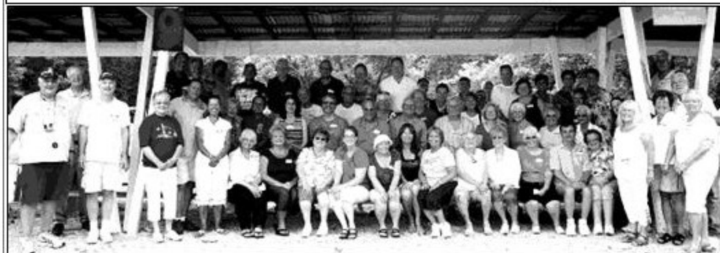
Some of the Champion alumni who gathered at Willow Lake on Saturday, June 19, 2010, to share memories of the past and catch up on what is going on in their lives today posed for a photo at Pavilion # 9. Even though the temperature was scorching, everyone seems to be all smiles!